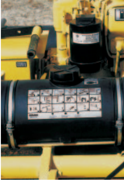
The detailed maintenance decal provides an easy to follow reference guide for the various components