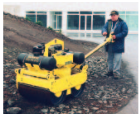
The BW75S-2 used successfully in over 100 countries.