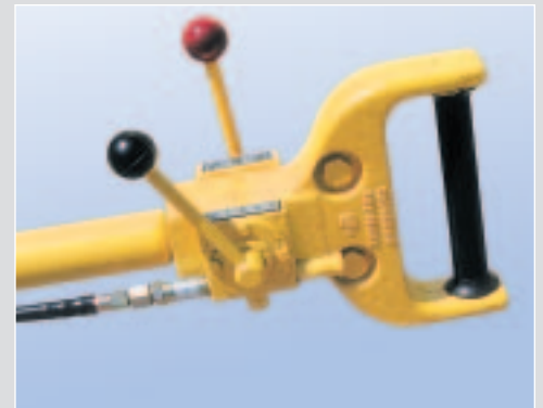
Easy, safe operation is a standard feature