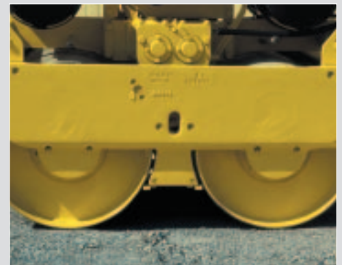
Thick drum shells provide maximum strength and durability

With these features and many more, it's easy to see why these models maintain a high residual value while delivering lower lifetime operating costs.